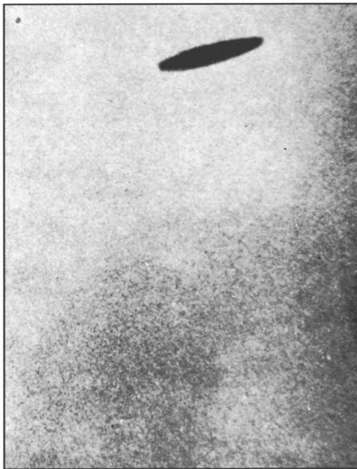
Fig 1. First photo by Kazuhiko Fujimatsu, October 11, 1974.