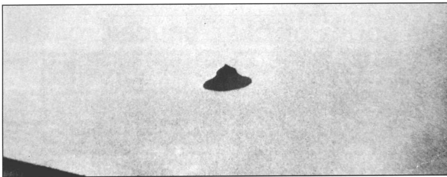
Fig 2. Second photo by Kazuhiko Fujimatsu, October 11, 1974.